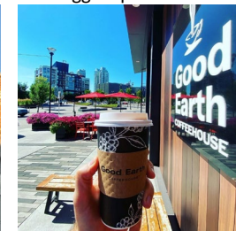
Good Earth East Village