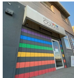
First on Colour