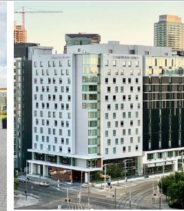
Hilton Garden Inn