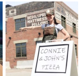
Connie & John's Pizza