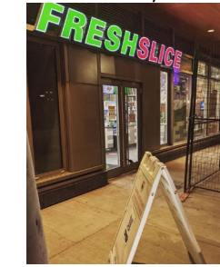
Fresh Slice Pizza