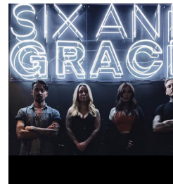
Six and Grace